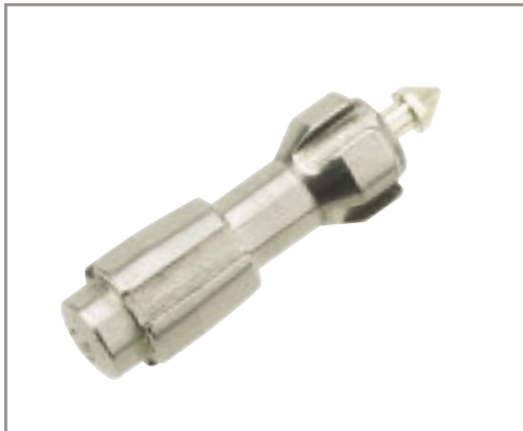
Diamond Impact Body

HT-2000A Package Includes: HT-2000A Hardness Tester Standard Test Block Micro Infrared Printer Support Ring .79" (20 mm) Support Ring .53" (13 mm) Plastic Carrying Case Tube Cleaning Brush CR-2330 Lithium Batteries (2) Operating Manual