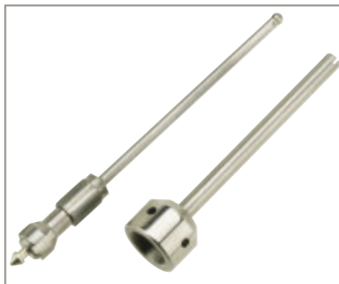
Long Test Tip Impact Body