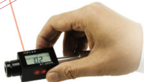
5. Transmit Data. (HT-2000A only)