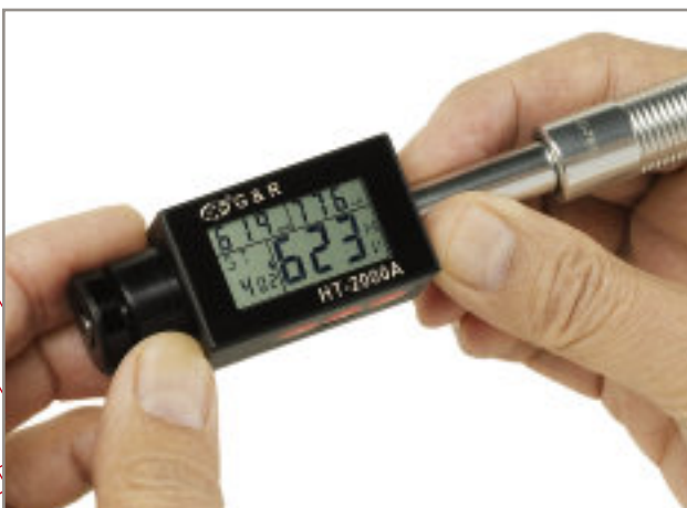
4. Read hardness.