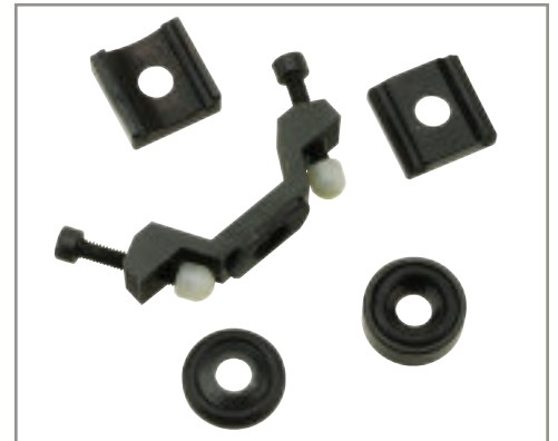
Special Support Rings