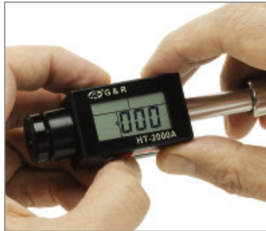
1. Select the material, hardness scale and direction.

The HT-1000A and HT-2000A have many applications in the primary metals, metal fabrication, utilities, petroleum, chemical, automotive and aerospace industries. Their small size and easy to use, one-handed operation make them ideal for testing large and heavy forgings or castings, such as steel mill rolls and turbine housings. Also, due to their small size and portability, the testers can be used to test individual parts of a large assembly without taking the finished assembly apart. The testers can be used vertically or horizontally, and require only a small surface area to obtain a quick and accurate reading. These versatile testers can be easily used by anyone, anywhere, to obtain direct accurate hardness readings.