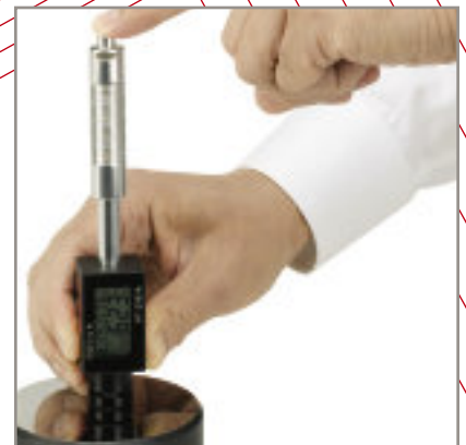
3. Place it on the material to be tested and push the button.